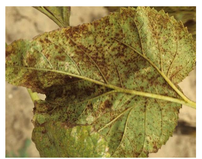
Fig. 1. Symptom of rust.

Rust is caused by the fungus, Puccinia helianthi . This fungus will only infect sunflower species and rusts on other plants will not infect sunflower. The disease can reduce head size, seed size, oil content and yield, but can only cause economic damage if it develops and becomes extensive in a crop prior to flowering. In general, confection hybrids are more susceptible than oilseed hybrids. Development of the disease on the crop after flowering will not affect yield. Free moisture on the leaves is required to initiate infection and epidemics occur during periods of rainy weather or heavy dews. Extensive rust development is shown in Fig. 1.