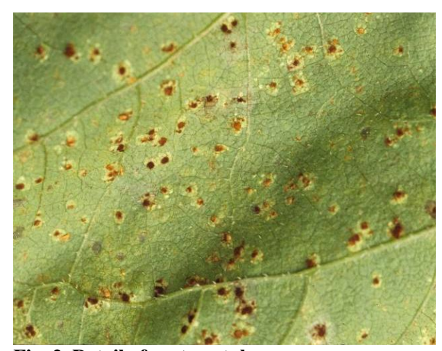
Fig. 2. Detail of rust pustules.

Field diagnosis: Rust pustules (Fig. 2) produce dark brown spores that easily rub off onto your fingers.