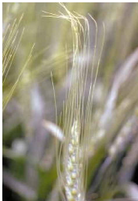
Figure 17: Symptoms of slight freeze damage may occur only on the awns as the spike is emerging from the boot or after heading. Awns become twisted and bleached or white instead of their normal green color. There may be no other damage to the rest of the plant.