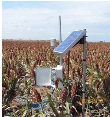
Hyperspectral measurement (left) and mast-mounted infrared thermometer system (right).