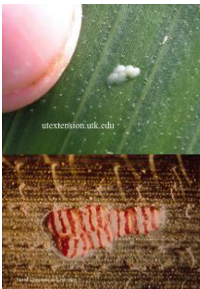
Fresh SWCB eggs (top) and 2-5 day old red line eggs (bottom)