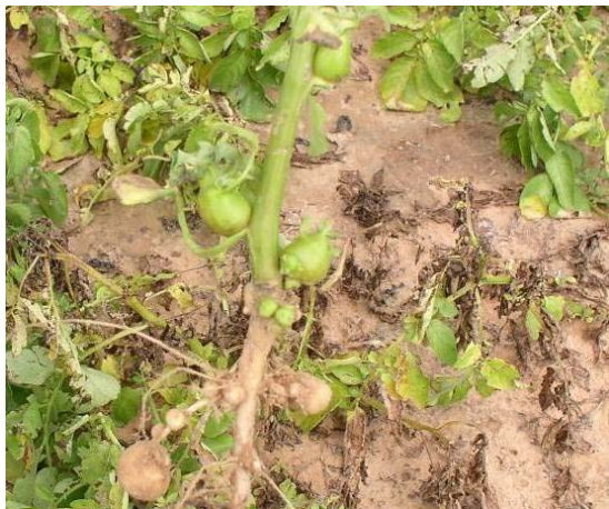
Figure 1. Aerial tubers.

Foliar symptoms can be similar to what is normally associated with Phytoplasmas or Fusarium . Symptoms of ZC include: wilt, yellowing, leaf curling, scorching, swollen nodes, proliferation of axillary buds, and aerial tubers (Fig. 1).