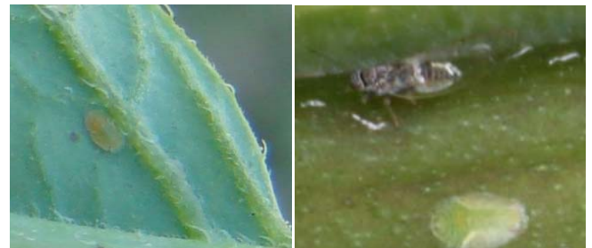
Figure 3. A nymph of the potato psyllid on the underside of a potato leaf (left). Close-up of an adult and nymph (right).

Candidatus Liberibacter solanacearum (CLs), a phloem-limited, non-culturable bacterium, is currently accepted as the causal agent of ZC. This pathogen is transmitted by the potato (tomato) psyllid, Bactericera (formerly Paratrioza ) cockerelli .